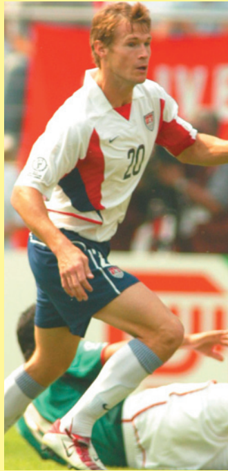
USL Hall of Famer and former Milwaukee Rampage strikers Brian McBride is headed to his third FIFA World Cup in June

The former Milwaukee Rampage forward registered 17 goals and 17 assists for the 16-2 Rampage in 1994 before becoming the first overall selection in the inaugural Major League Soccer Draft and eventually moving onto the English Premier League.